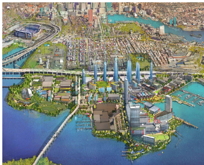
http://data.baltimoresun.com/news/port-covington/ - A rendering of the proposed Under Armour campus at Port Covington.

Current research sponsors include the Abell Foundation; the Annie E. Casey Foundation; The Urban Institute; the Maryland Association of Community Colleges; the Governor’s Office of Crime Control and Prevention; the Maryland Department of Human Resources; the Maryland Department of Labor, Licensing and Regulation; the Maryland State Department of Education; the Maryland Department of Business and Economic Development; the Maryland Department of Health and Mental Hygiene; and the University System of Maryland.